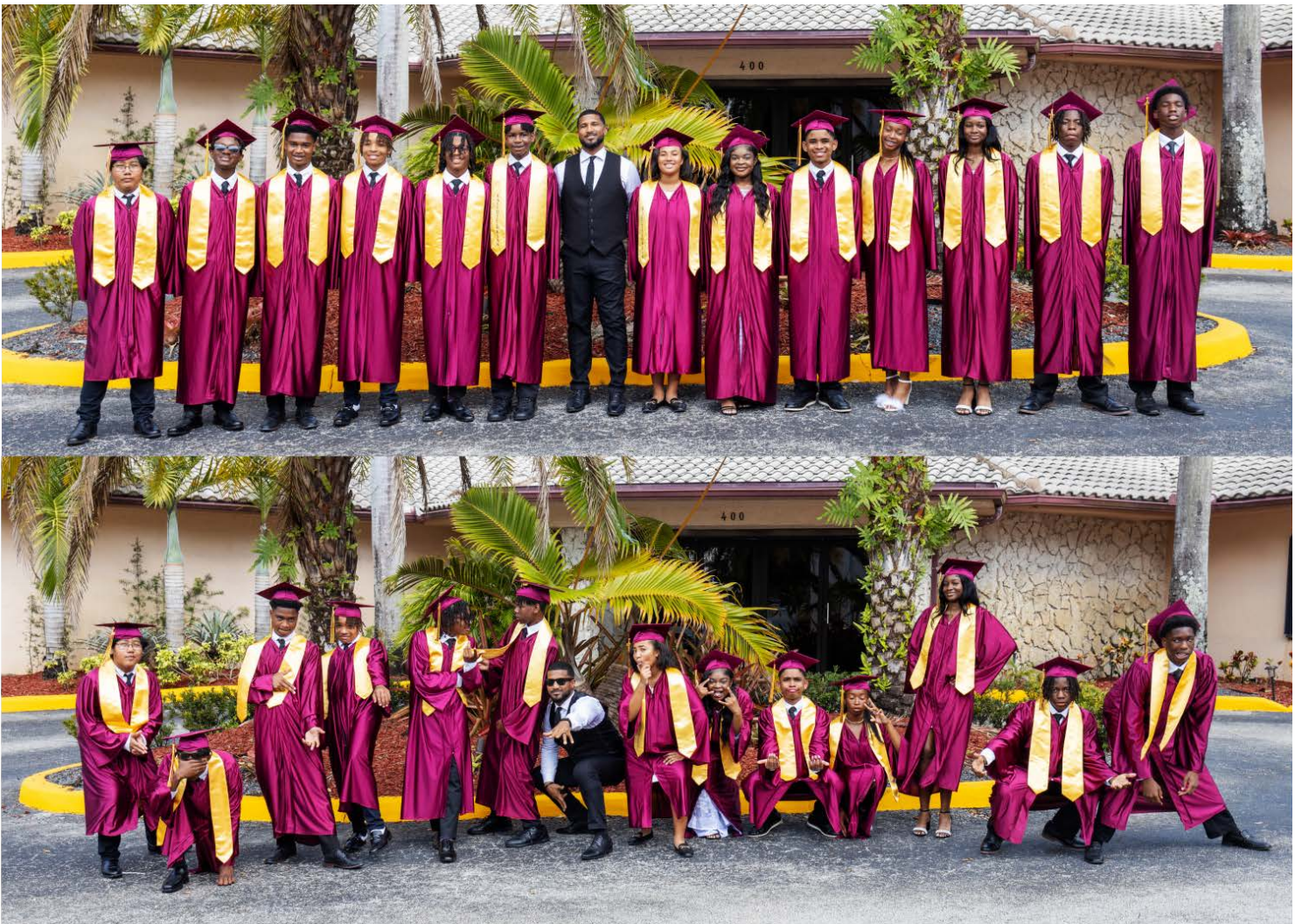
Graduating Class of 2024